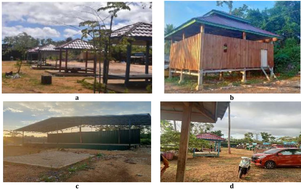
Figure 4. fasilitas yang tersedia facilities available at Lake Laponu-ponu tourism objects, a. gazebo. b. prayer room (mushala). c. public stage. d. motor vehicle parking.

The facilities available at Lake Laponu-ponu can be seen in figure 4, the existing facilities consist of 12 gazebos neatly arranged on the edge of the lake, the gazebo can be used for tourists. The prayer room (mushala) is provided by the manager for tourists to worship for Muslim tourists so that tourists who are muslim do not need to go far to find a place of worship. In addition to places of worship, the facilities available are public stages, this stage can be used as an entertainment stage for an event. In addition, other facilities such as vehicle parking, health posts and toilets are also available at the location of Lake Laponu-ponu tourist attractions.