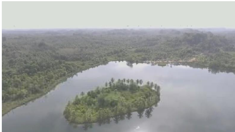
Figure 2. the natural beauty of Lake Laponu-ponu

flora and fauna, besides that Lake Laponu-ponu is also used as a place to conduct study tour activities for students in Bombana Regency. The beauty and uniqueness of Laponu-ponu lake as shown in figure 2, has its own charm so it really needs to be developed.