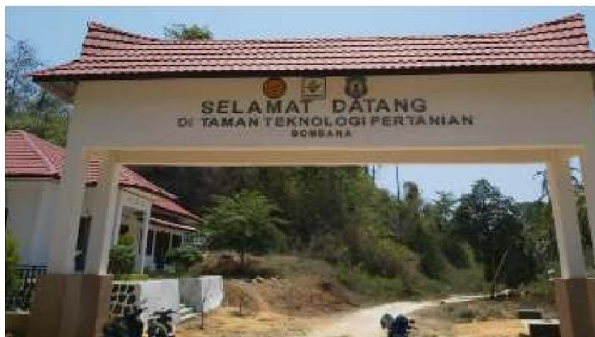
Figure 3. access to Laponu-ponu Lake

Accessibility is an ease to reach a destination, Lake Laponu-ponu tourism objects have easy access to reach by visitors or tourists because road access to tourist objects is 750 m from the Pomala - Boepinang axis road. Laponu-ponu lake tourism objects can be accessed by land trip using 2 (two) wheels and 4 (four) wheels. The existence of good road access is one of the driving factors for the progress of a tourist attraction. All the access needed will certainly be easier with adequate infrastructure, especially in the use of transportation, it's just that the lack of availability of public transportation is one drawback that in the future needs to be provided so that it can be used by tourists who will end up at Lake Laponu-ponu.