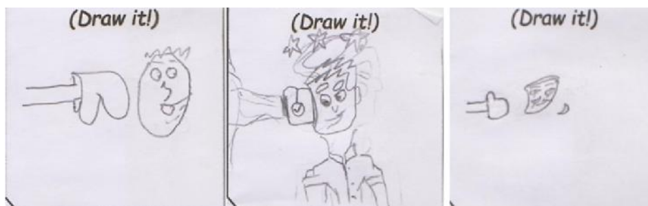
Figure 2. Drawings by (from left to right) P1, P2, and P3 for the word “punch”.