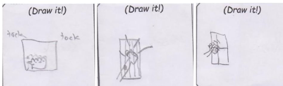
Figure 3. Drawings by (from left to right) P4, P5, and P6 for the word “knock”.

The pupils’ entries in the journal showed that they enjoyed drawing simple illustrations of words they had learnt (see Figures 2 and 3). They did not copy the pictures from a source, but were able to draw images from their own imagination. This was evidenced by the variety in drawing styles and high level of personalisation to the drawings.